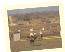
Point-to-points are run by a Committee of Hunt volunteers and are regulated by the Jockey Clubs. Each horse has been fairly hunted and has a certificate to prove it. It is the making of many young riders and horses who progress into a racing career.