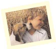
Foxhounds are a delight. They are not the savage beasts others have tried to paint them - they are often better mannered and more tempered than most pets.