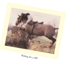
Being for a fall